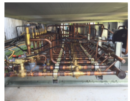
REFRIGERATION CIRCUITS (BELOW A CONDENSER OF A LINK+)