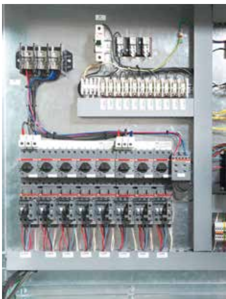
ELECTRICAL/ CONTROL PANELS