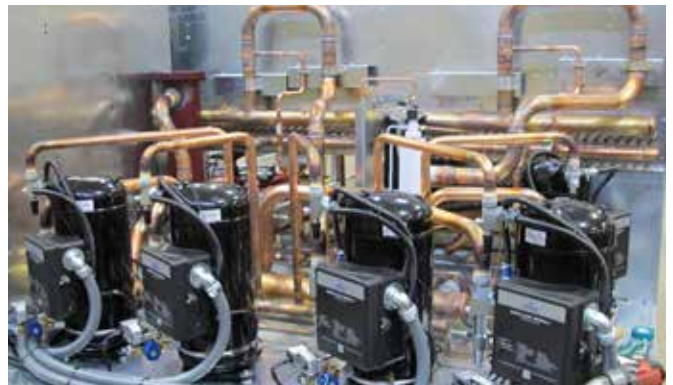
PARALLEL PIPED SCROLL COMPRESSORS