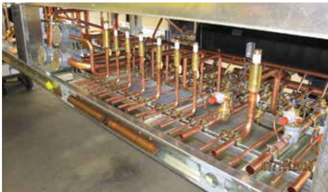
REFRIGERATION CIRCUITS UNDER LINK+ CONDENSER