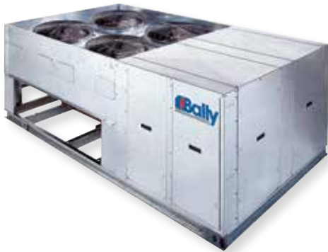
MULTIPLE COMPRESSORS IN CABINET WITH CONDENSER ATTACHED