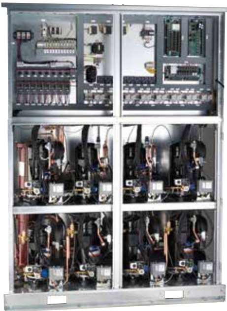
CENTRALIZED PIPING AND ELECTRICAL