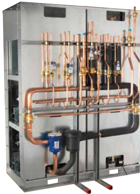
FLEXIBLE REFRIGERATION CONNECTIONS